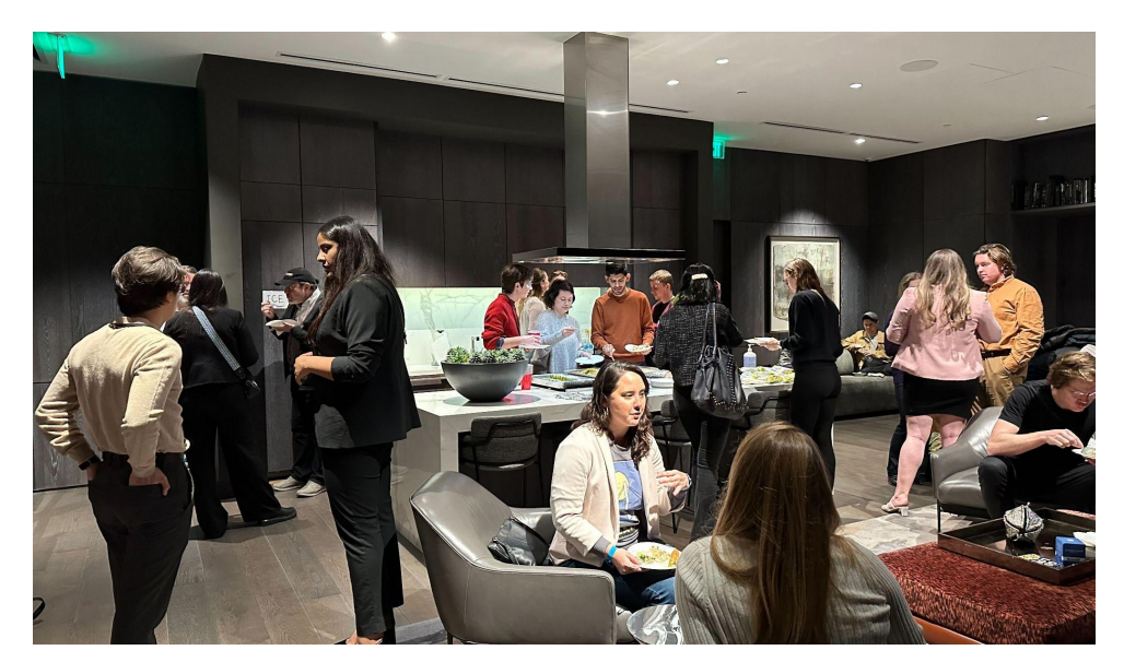
Law & Longtermism dinner with attendees of EA Global Bay Area 2023

• We organized two informal dinners during the <u>EA Global</u> conferences we attended (in Cambridge and DC). Attendees were primarily other EA Global participants with a background in law and policy.