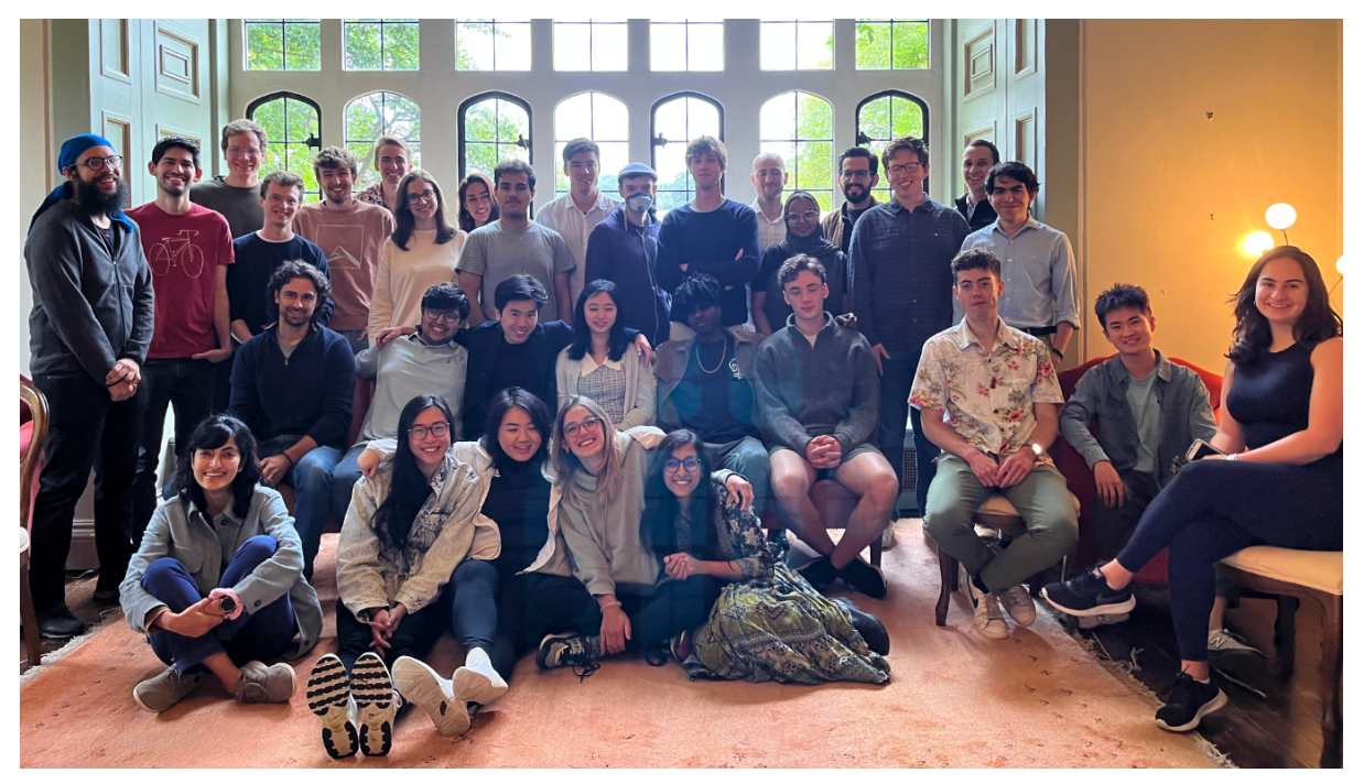
LPSI 2022 participants