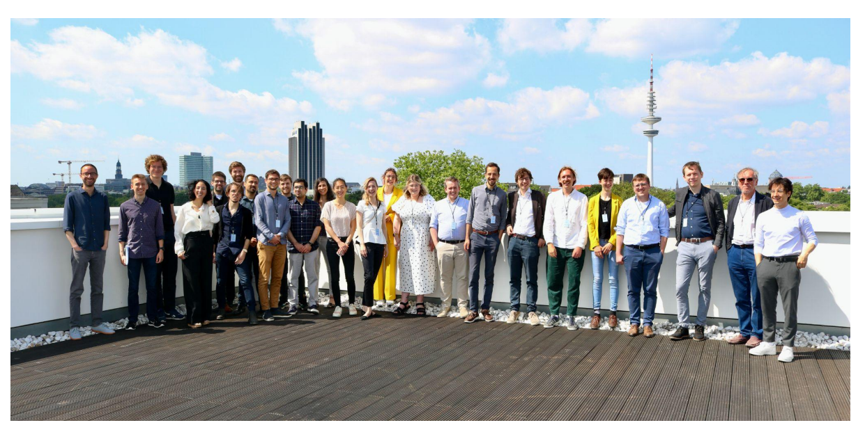
Participants of the Multidisciplinary Forum on Longtermism and the Law

Overall, I was very impressed with the organization. Everyone was easy to talk to, and it felt like I had an opportunity to speak to everyone without it being too small. Very excellent, in my view.